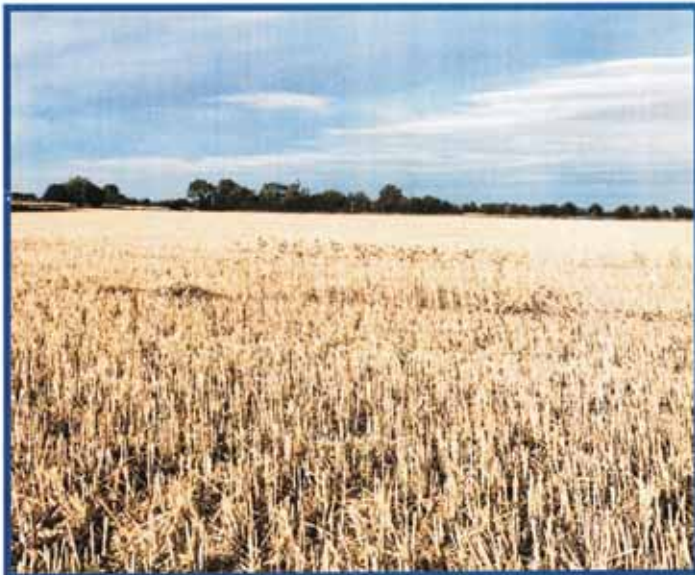
Looking towards Crowfield, 2020

Sun 17 October, 09.30am, Harvest at Crowfield